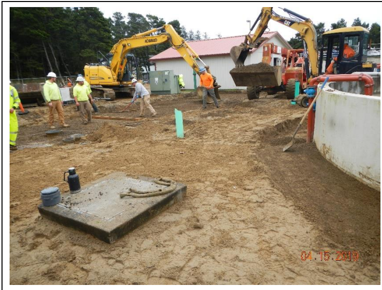
Setting final surface grade ground digesters 3&4.