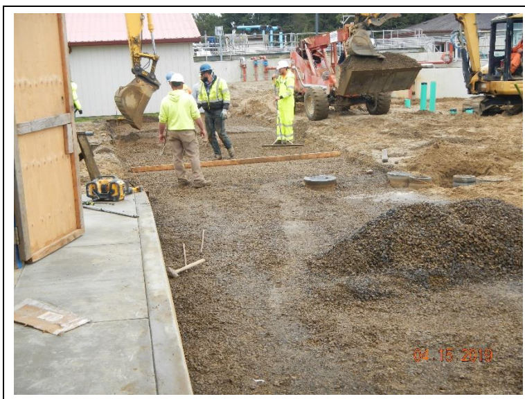
Setting final gravel subgrade on SBR access road.