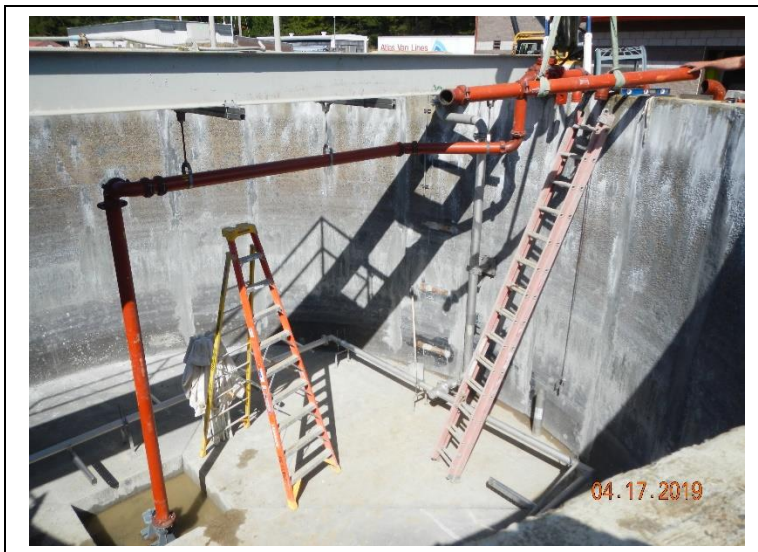
Installing digester 5 DR and drain piping.