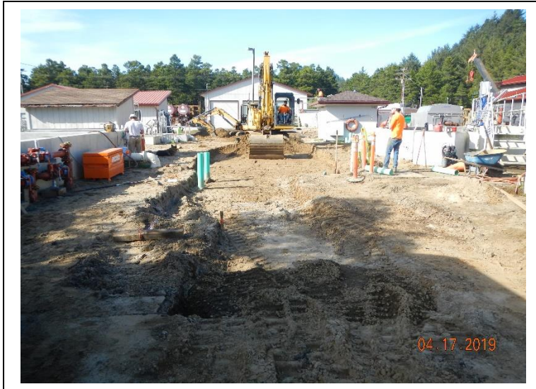
Setting subgrade on the existing access road west of the digesters