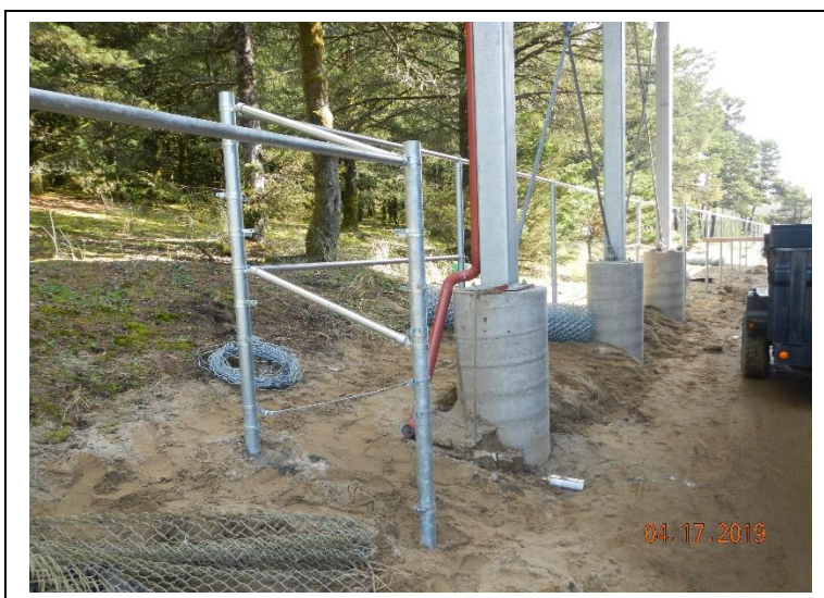
Installing new section of fencing around the truck loading area roof supports.