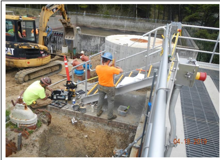
Installing the northside stairs and hand rails at the headworks.