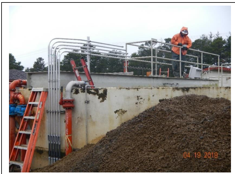
Running conduits for digester 5 equipment.