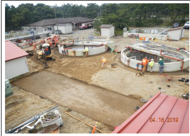
Setting the surface grade around digester 1,2,3, &4.