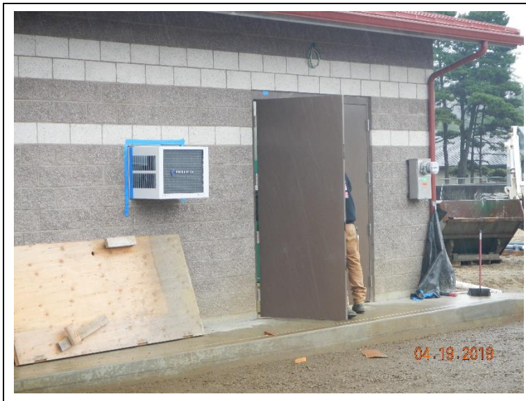
Installing doors on electrical room.