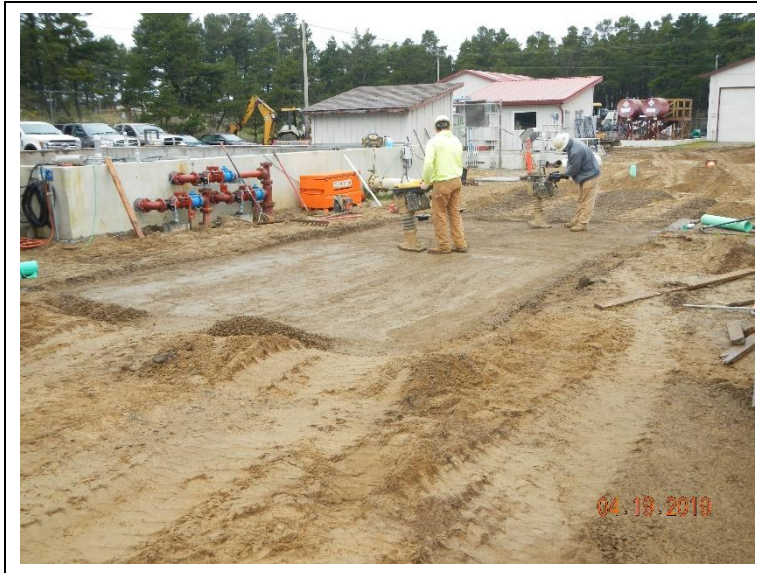
Setting gravel subgrade on roadway west of digesters 3&4.