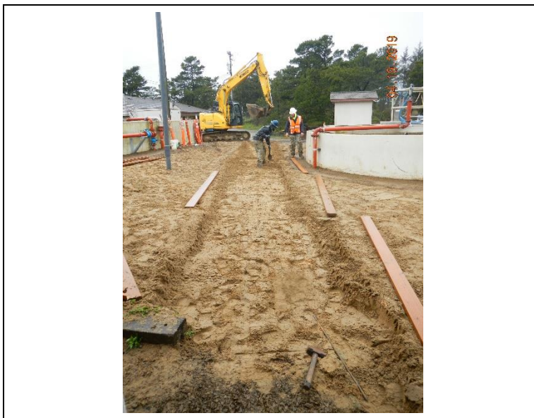
Working on walkway to FEB blower room.