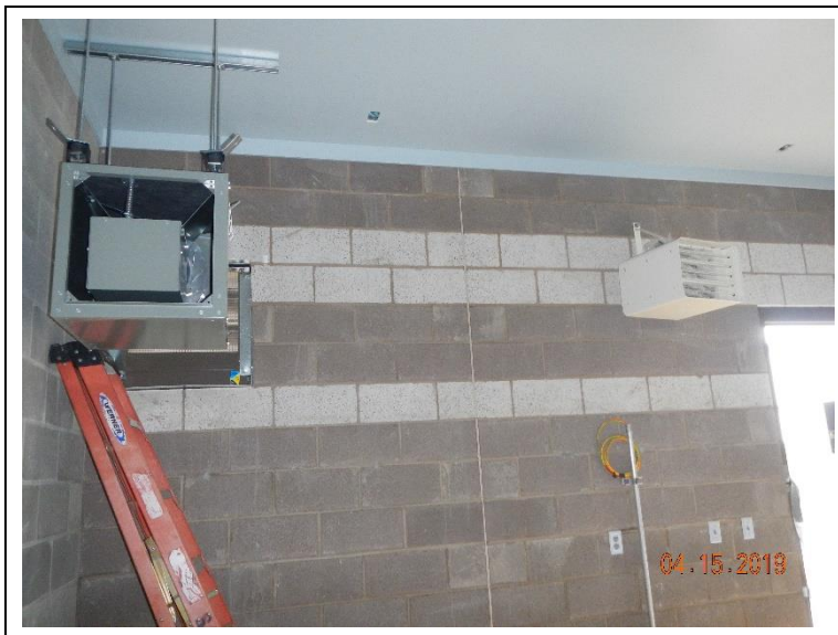
Installing the supply fans and heaters in the blower room.