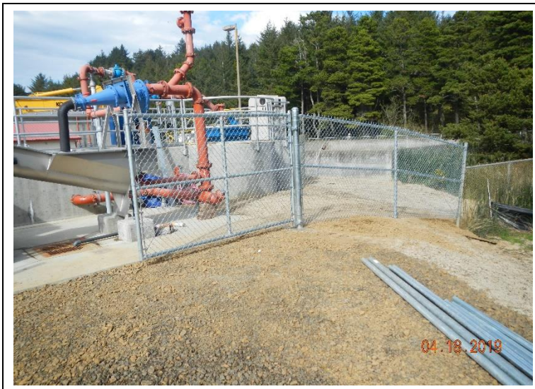
Installing new fencing south of the headworks.