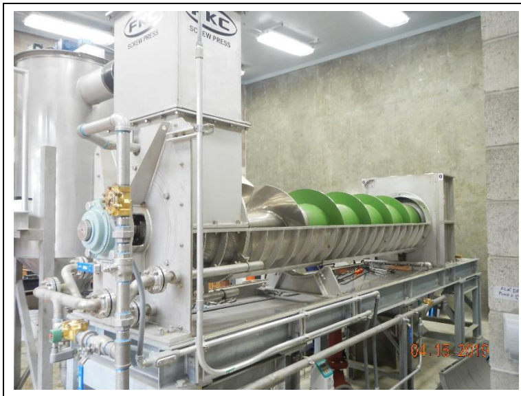
Conducting the initial inspection of the solids screw press before startup.