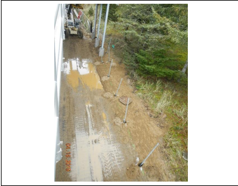
Setting the new fence post along the eastside of the SBR.