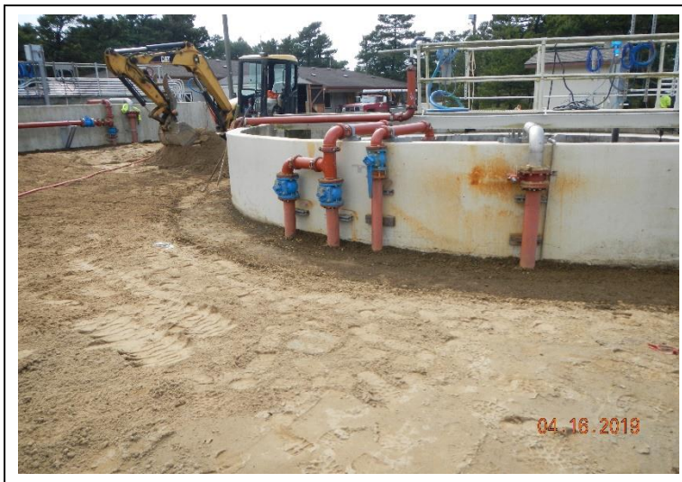
Completed backfilling gravel around digester 1&2 and setting surface grade.