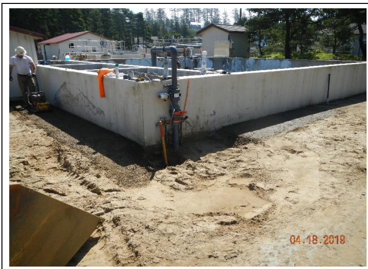
Backfilling around the filter holding tank with gravel.