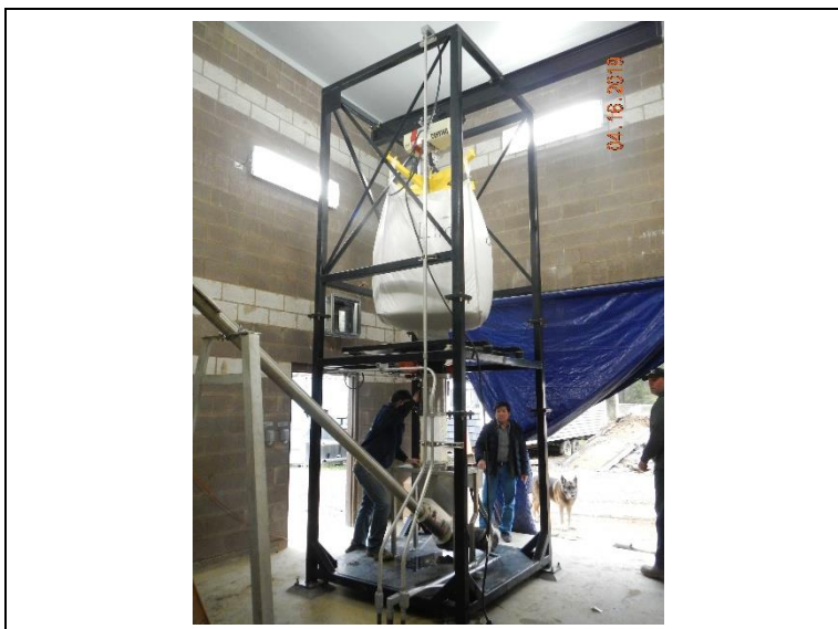
Placing the tote of lime in the lime discharge unit and running lime up the conveyor.