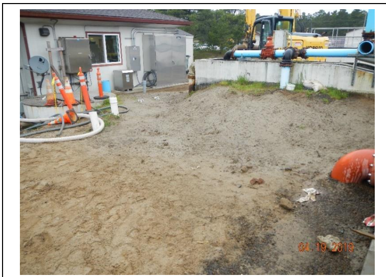
Setting final surface grade west of the headworks.