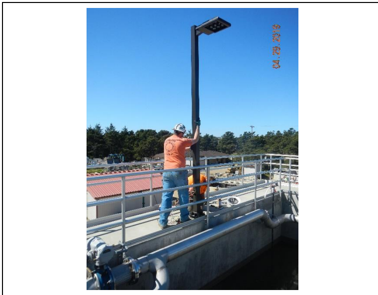
Installing the SBR light poles.