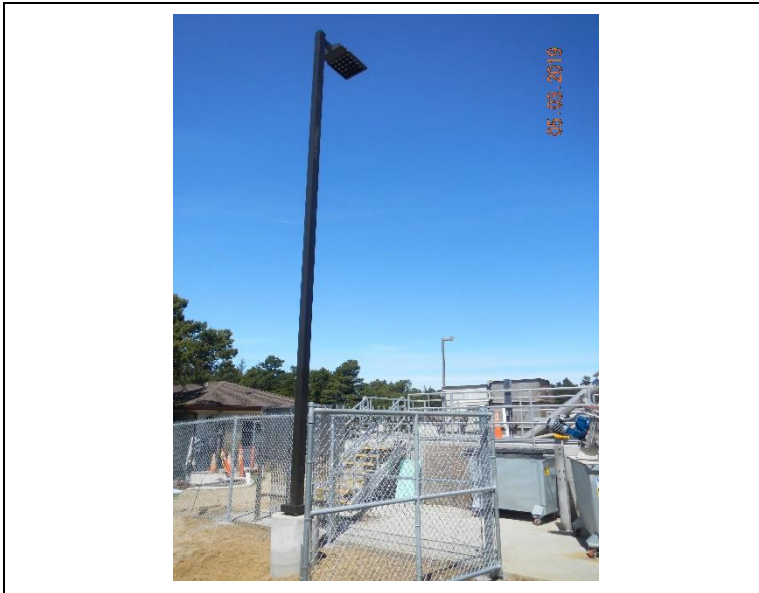
Installed the light pole next to the headworks.