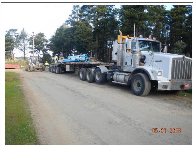
Loading up supplies and equipment and hauling off site.