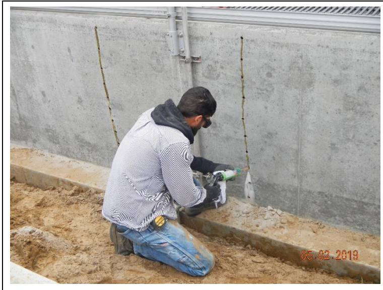
Installing epoxy sealer on headworks cracks.