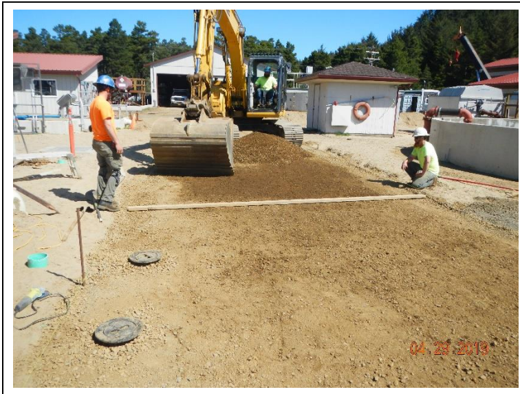
Setting the final subgrade on the digester access road.