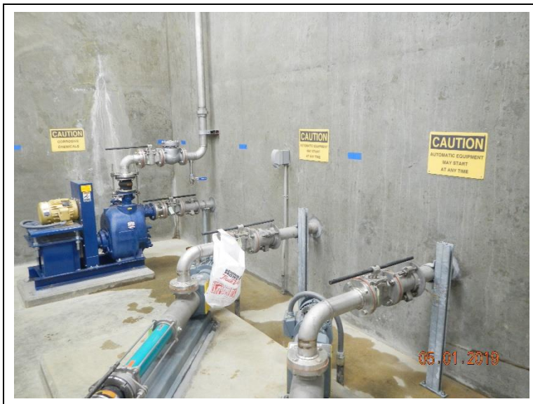
Installing signage in the solids room.