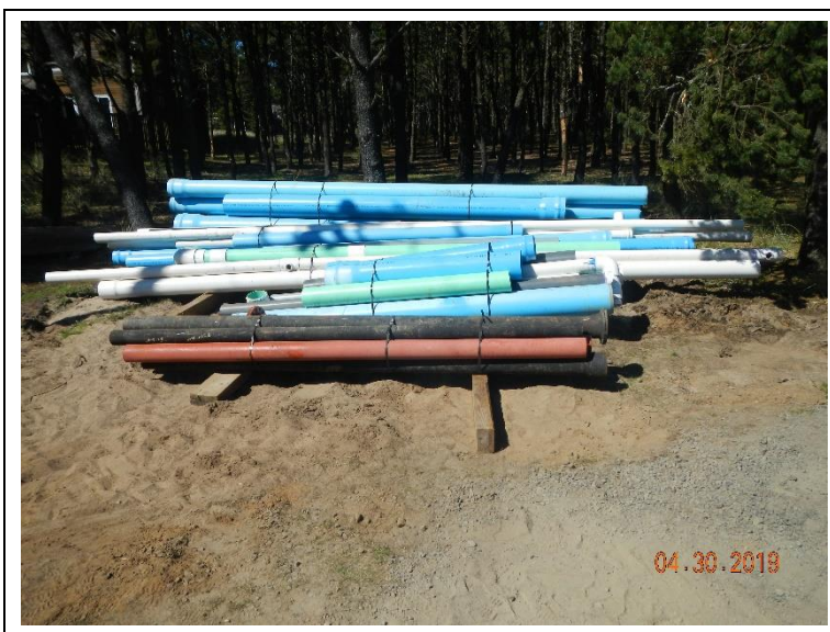
Staging equipment and supplies to be hauled off site.