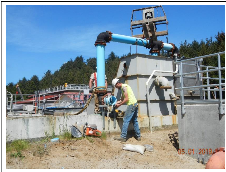
Removing the temporary bypass piping from the former headworks.