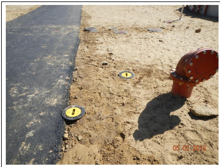
Color coded all valve covers.