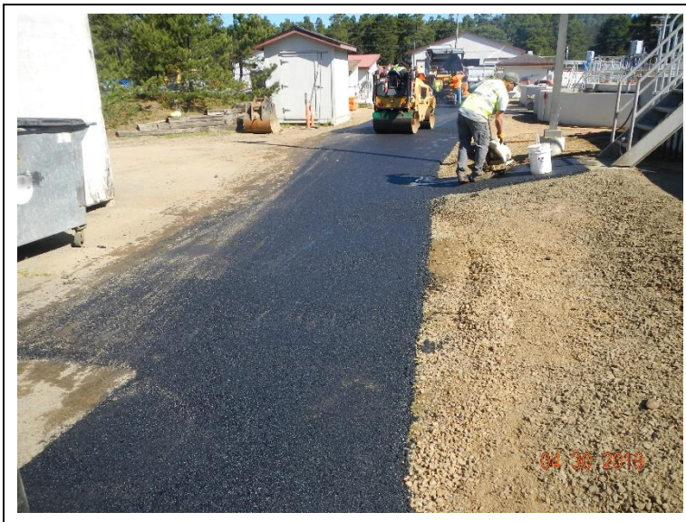
Paving digester access road.