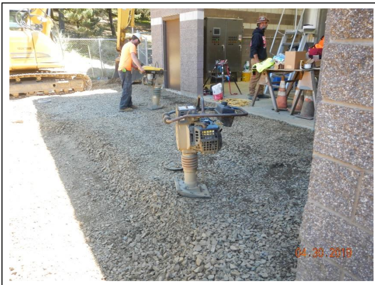
Backfilling and setting grade in front of solids room.