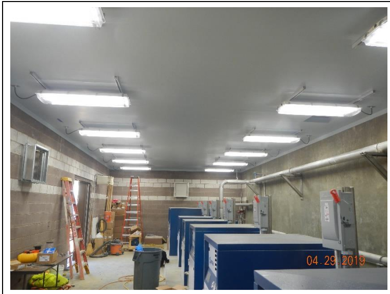
Completed installing the blower room light fixtures.