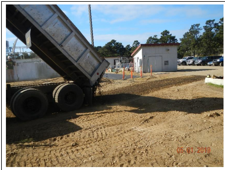
Backfilling and grading the north access