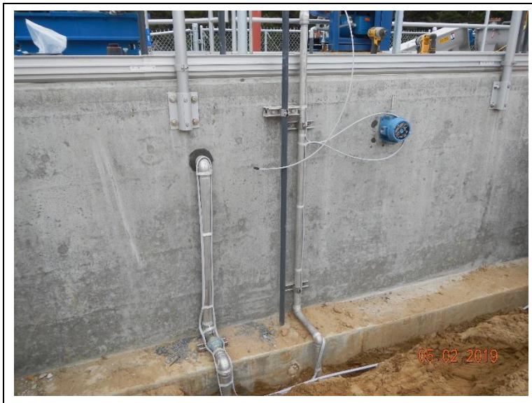
Installing heat trace wiring on headworks piping.