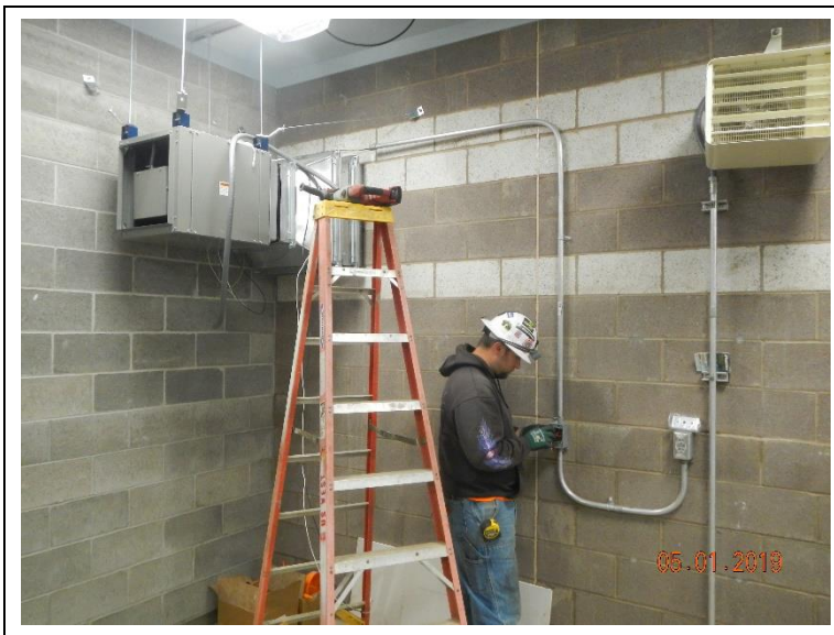
Wiring the supply fan in the blower room.