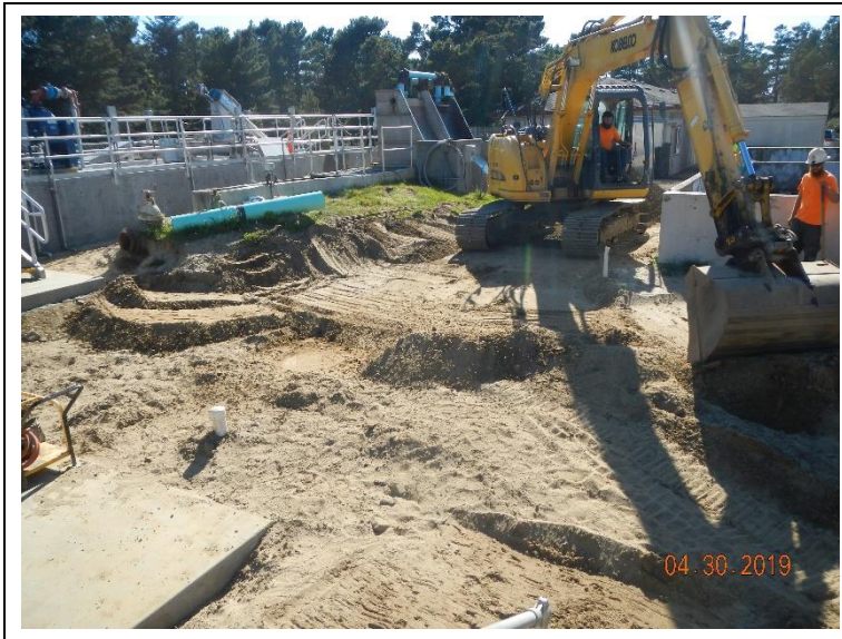
Setting grade around headworks, digester 1, and FEB.