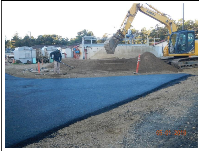
Completing the grading round digester 5.