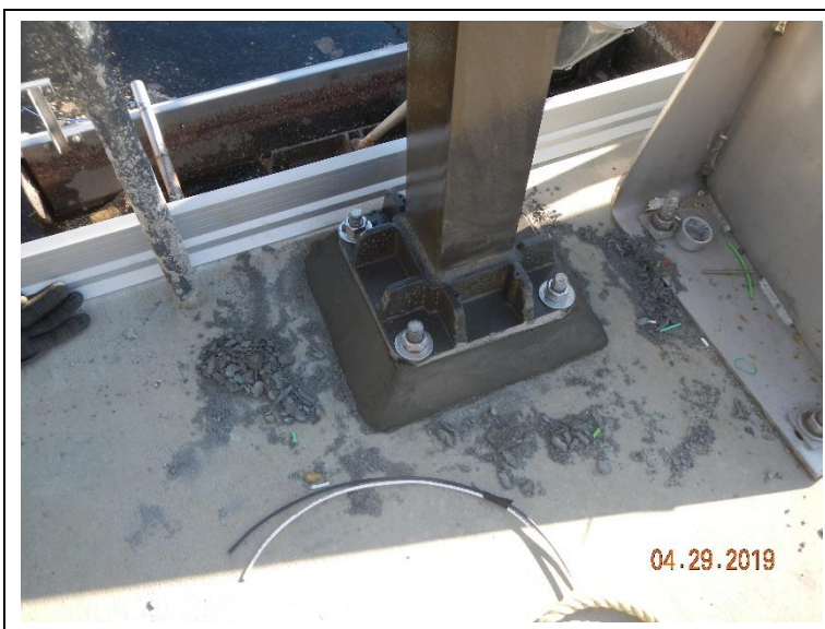
Grouting the SBR light pole bases.