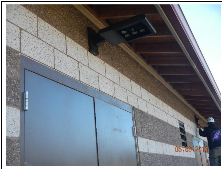
Installing light fixtures above the blower room doors.