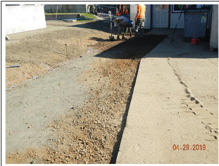
Cutting a straight edge to match the existing asphalt.