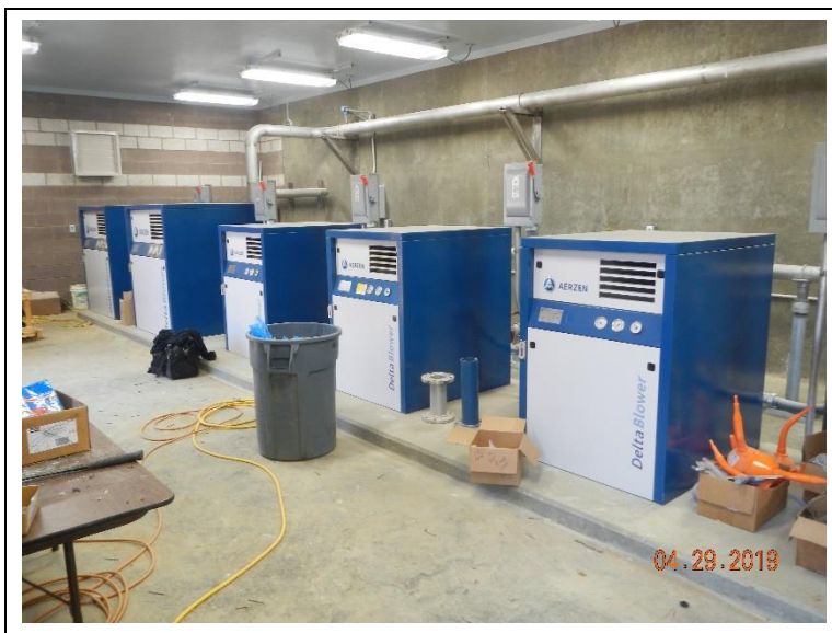
Cleaning up the blower room and removed the protecting lumber from around the blowers.