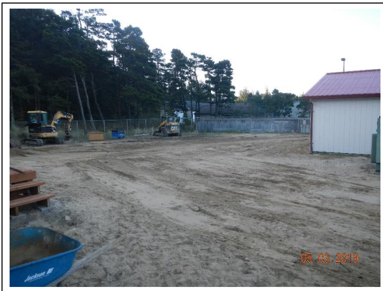
Finishing site grading south of the SBR.