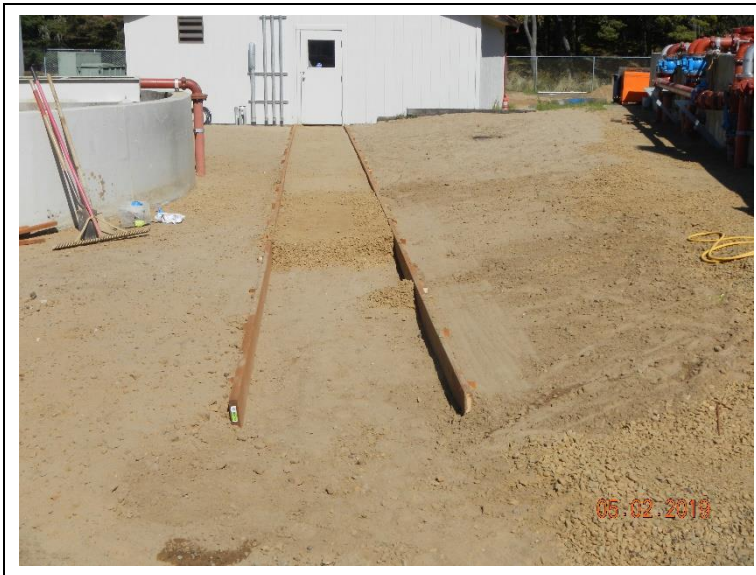
Completing the gravel walkway to FEB blower room.