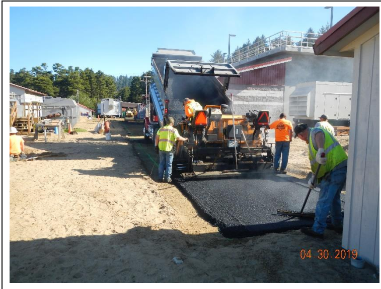
Paving SBR access road.