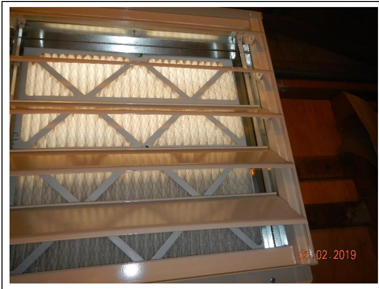
Installed air filters in all air supply opening.