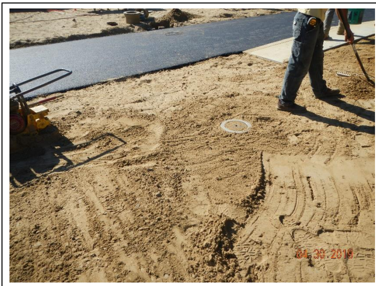
Installed copper grounding rods at all four corners of the SBR.