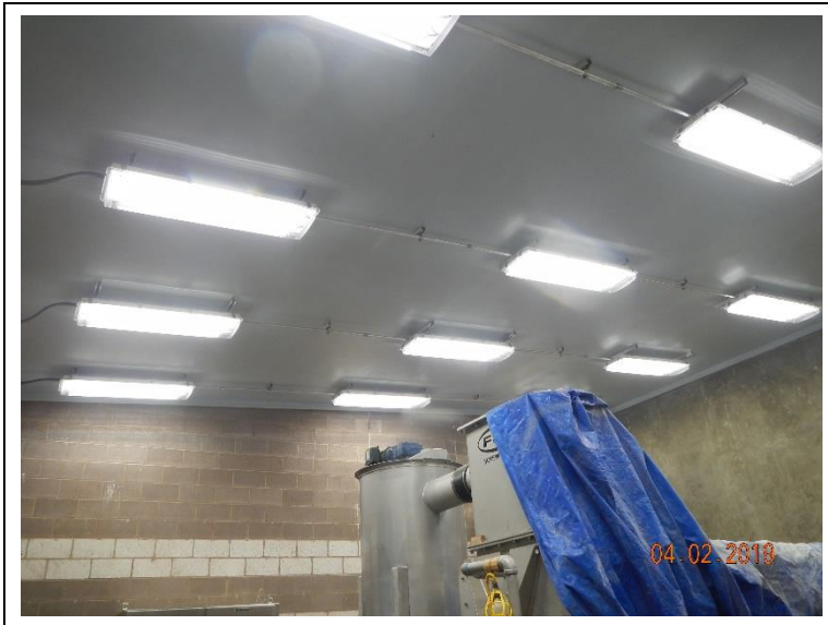
Completed installing and wiring light fixtures in the solids room.