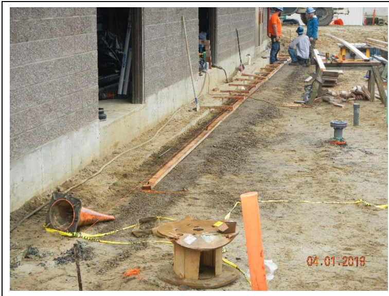
Constructing the curb forms for the sidewalk.