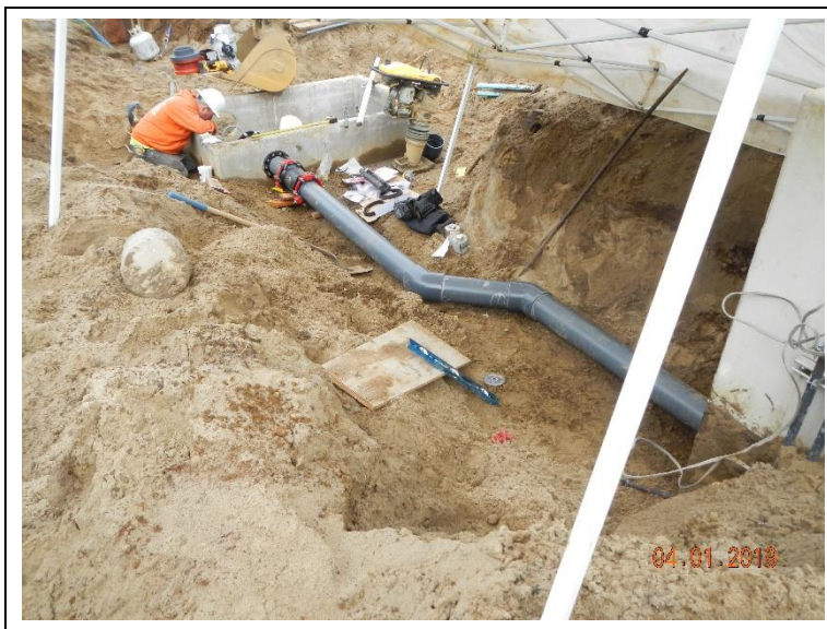
Installing the reuse water piping from the valve vault to the reuse tank.