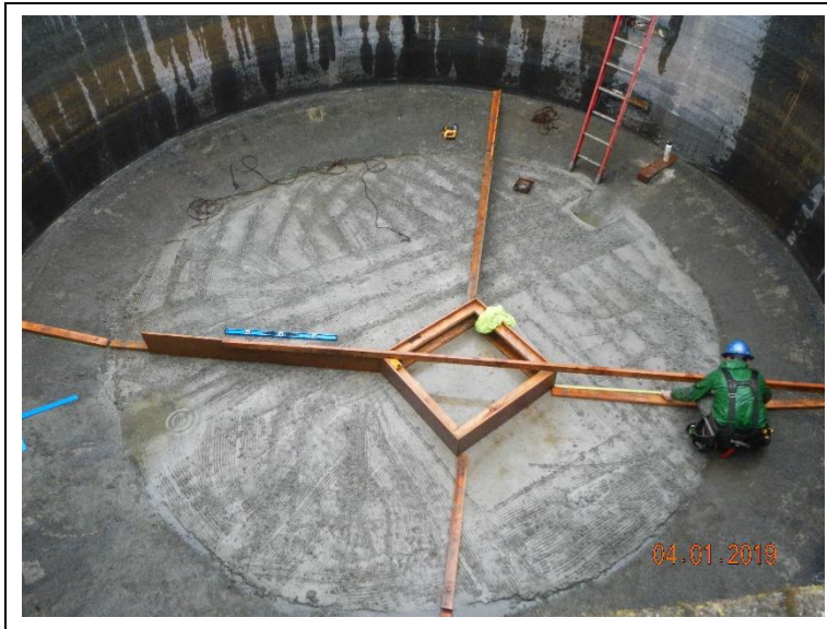
Constructing the floor forms in digester 5.