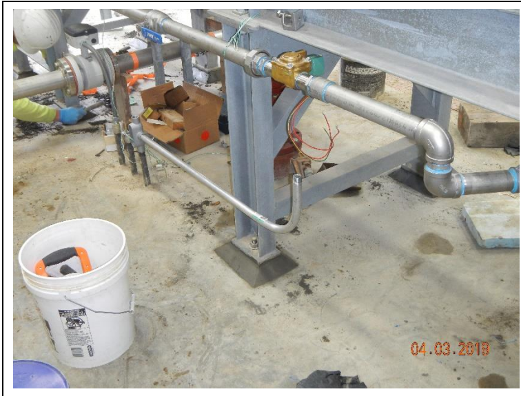
Running conduit and pulling wires to solids equipment.