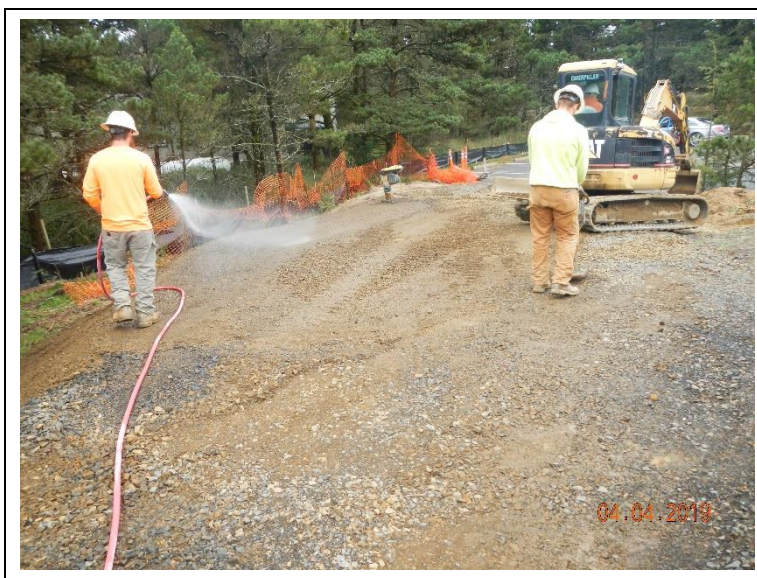
Placing rock on the headworks access road.