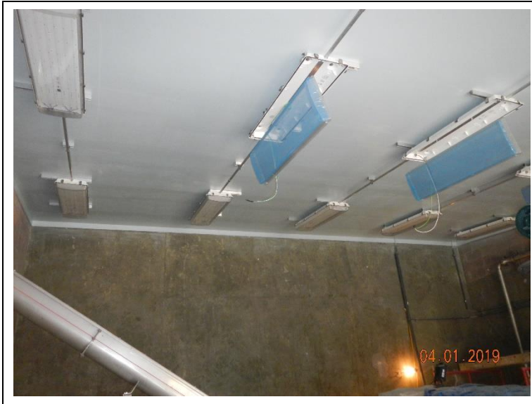
Wiring the solids room lights fixtures.