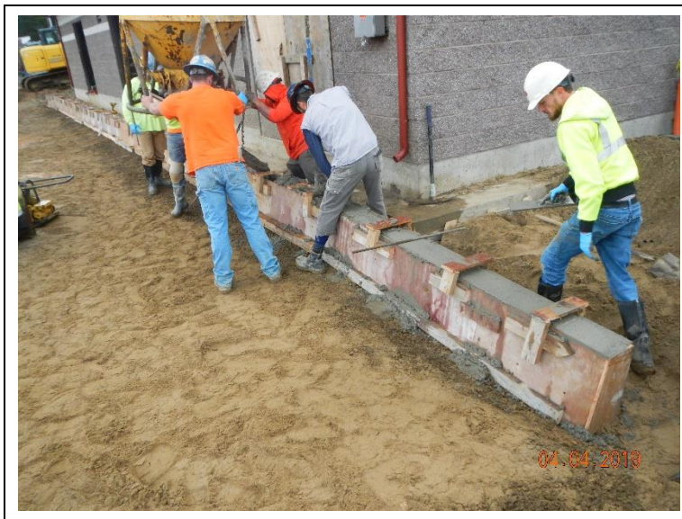
Pouring sidewalk curb.