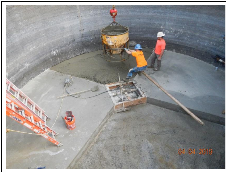
Pouring the other half of digester 5 floor.