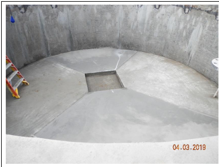
Completed digester 4 floor.