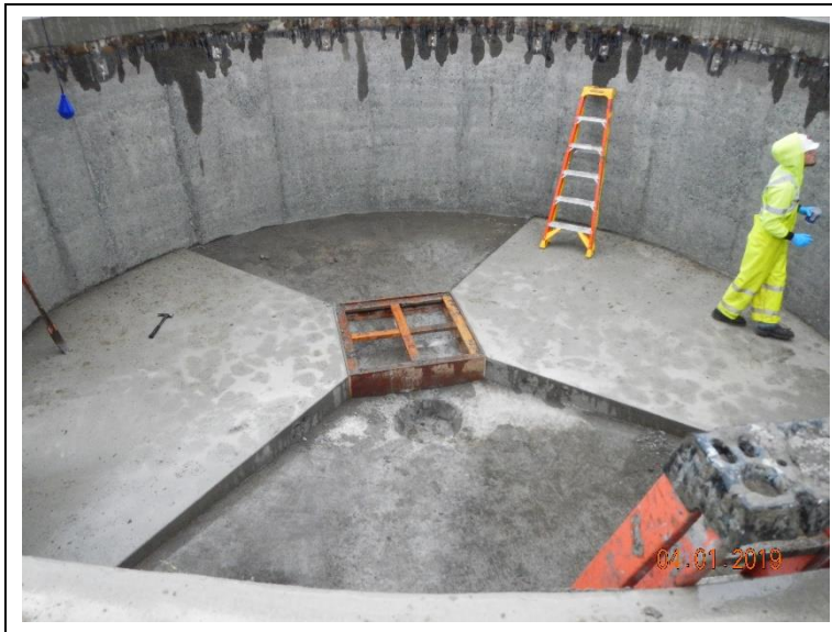
Removing the floor forms in digester 4.