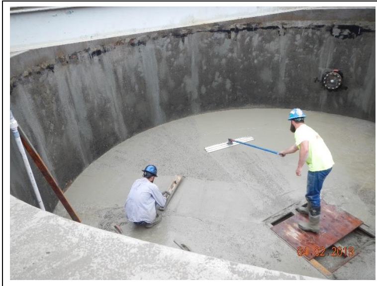
Finishing digester 4 sloped floor.