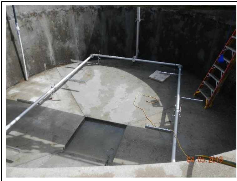
Installed aeration diffuser piping in digester 4.