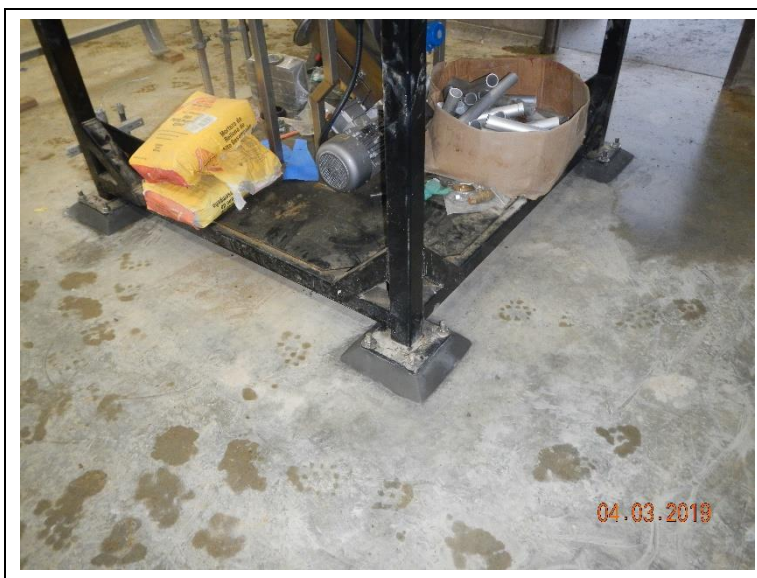
Grout pads under lime discharge unit frame.