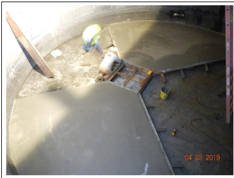
Pulling forms off digester 5 floor.