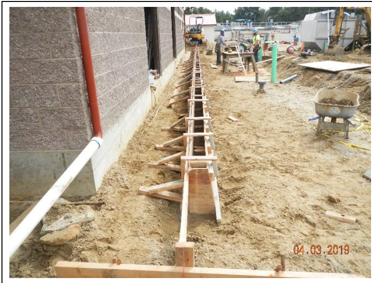
Completed sidewalk curb forms.