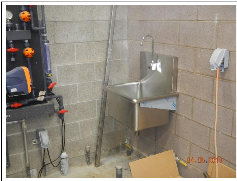
Installing utility sink in solids room.