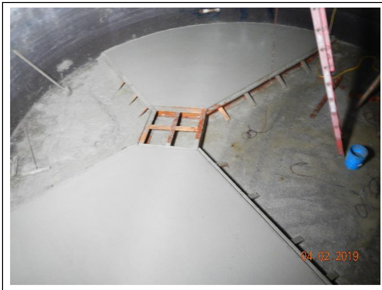
Completed pouring half of digester 5 sloping floor.