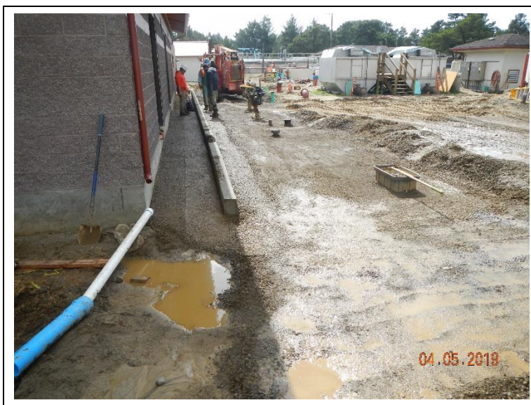
Setting subgrade for side walk and SBR access road.